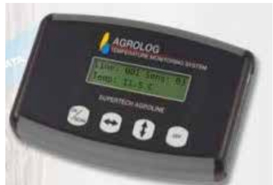
— Photo TMS2500 hand terminal